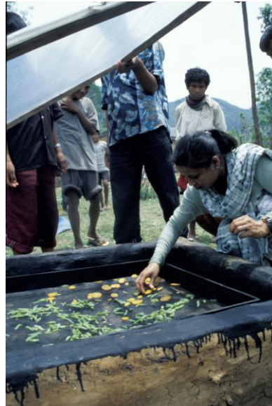
Figure 1: Putting vegetables into the dryer.

A small piece of land about 1.8m x 2.4m or 6'x 8' receiving sufficient sun is prepared as a platform. Bricks or stones (whichever is locally available) are laid down to make the base of the dryer. The dryer is slanted by about 20 degrees from ground level facing towards the equator. Small bamboo pipes are placed at certain distances along the wall of the dryer as inlets for cool air or holes can be made during construction. Small windows or gaps on the top of