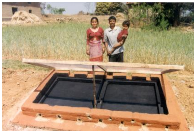
Figure 5: The finished dryer.

Development: A Series of Practical Guides , written by the Natural Resources Institute .