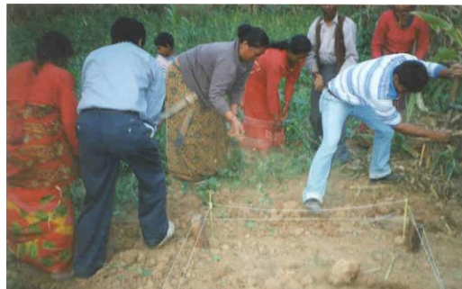
Figure 2: Laying out the groundwork for the dryer.