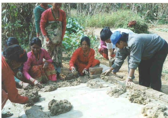
Figure 4: Laying the bricks.