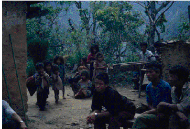
Figure 1: Chepang people training in the Kandrang Valley with an oil expeller in the background.

The Chiuri tree is a medium sized tree native to Nepal. It grows mainly in the sub-Himalayan tracts on steep slopes, ravines and cliffs at an altitude of 400 to 1400 meters, particularly in the Chitawan district. Its botanical name is Diploknema butyracea Roxb syn. Bassia butyracea , syn. Madhuca butyracea , syn. Aesandra butyracea . It is also named "butter tree". The main product of the tree is "ghee" or butter, extracted from the seeds and named "Chiuri ghee" or "Phulwara butter".