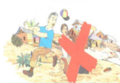
Actions that may increase our vulnerability