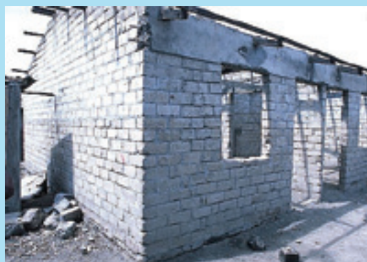
House is being built with stabilised soil blocks in Bondeni, a century old low-income settlement of Nakuru, Kenya

This house is being built with stabilised soil blocks in Bondeni, a century old low-income settlement of Nakuru, Kenya. Practical Action collaborated with others in Kenya to campaign for the adoption of performance building standards to replace prescriptive standards. Thus, construction with stabilised soil is now permitted. In addition, the NGO worked with the municipality of Nakuru to speed up the building permit process. This makes it easier for low- to medium income urban households to build houses formally, and to end up with registered titles.