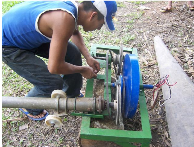
Figure 4: Setting up the fan belt and permanent magnet generator .

The floats can be made in a number of ways based on what is most suitable in terms of the materials available. This could be a boat. In Peru balsa wood float(s) were made locally by inhabitants of the village were used as this was the cheapest option.