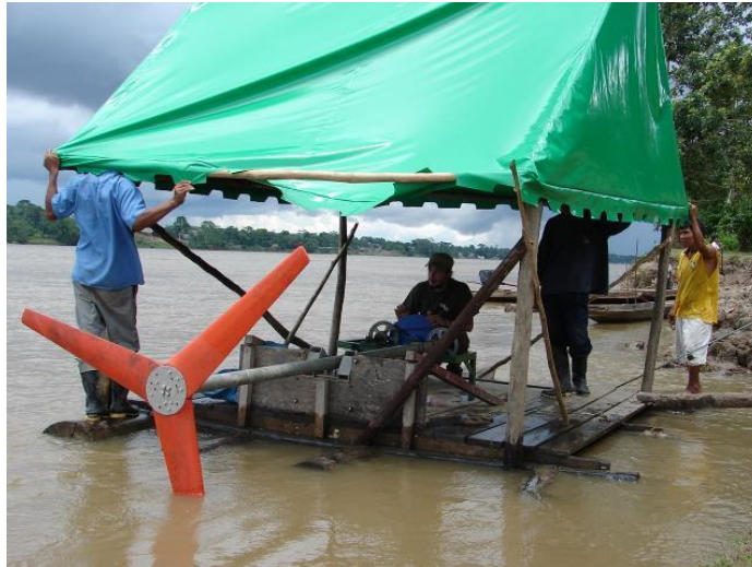
Figure 1: A river current turbine in Peru.

The hydro-kinetic turbines are designed to generate electricity solely from the kinetic energy of running water in a river or from tidal currents when used in marine settings. The conventional technique of generating electricity from hydrological energy is done using water from a high position that falls through a head onto a turbine, where water is channelled along canals and pipes in order to make use of its potential energy. This approach is covered in the Practical Action technical brief on micro hydro.