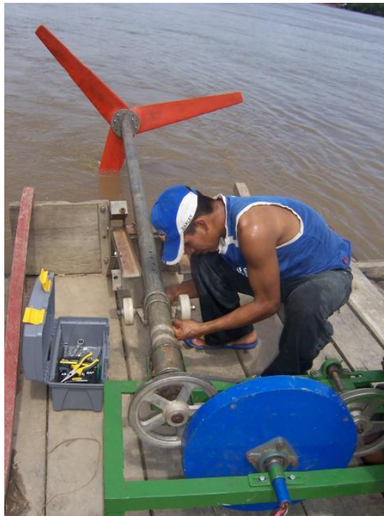
Figure 3: A robust and simple design was developed for remote locations. A simple permanent magnet generator was designed (painted blue).

In order to reduce costs, and to be able to rely on locally-made technology, Practical Action began by working on the development of a permanent magnet generator. The magnets allowed the speed of generation to be reduced, and lowered the cost of the equipment, which itself could be adapted to be a river turbine rotor, and ultimately, tested and built. The main components of the system are: the generation of alternating current which, via a system of rectifying diodes, transforms the voltage to 12V, and 250W of power at 360 rpm.