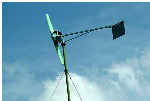
Figure 2 : Small wind turbines can play an important role in rural areas of developing countries.

Unlike the trend toward large-scale grid connected wind turbines seen in the West, the more immediate demand for rural energy supply in developing countries is for smaller machines of up to about 60 kW. These can be connected to small, localised micro-grid systems and used in conjunction with diesel generating sets and/or solar photo-voltaic systems.