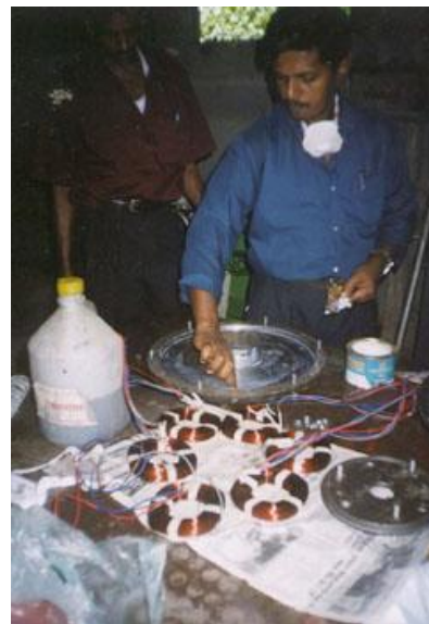
Figure 5 : making a PMG in Sri Lanka.

The design of the PMG is suitable for low volume manufacture in developing countries. More information on how to make a permanent magnet generator can be found in the document The Permanent Magnet Generator (PMG): A manual for manufacturers and developers.