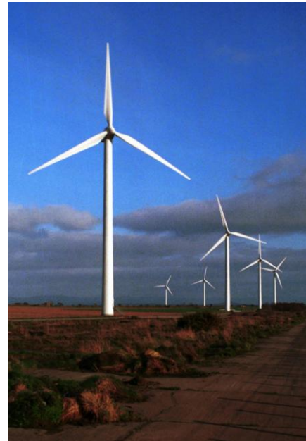
Figure 1 : Wind turbines are getting bigger and wind farms are more common. Great Orton Windcluster.

To a lesser degree, there has been a parallel development in small-scale wind generators for supplying electricity for battery charging, for stand-alone applications and for connection to small grids. Table 1 shows the classification system for wind turbines: