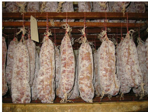
Figure 4: Sausages being cured.

Preservation is due to a number of factors: the antimicrobial action of the salt; up to 2% lactic acid from the fermentation; reduced moisture content; nitrite-spice mixtures; and antimicrobial components in smoke when the product is smoked. Examples of semidry sausages are summer sausages, landjaegar, different types of cervelats, thuringer, metwursts and Lebanon bologna. For example, landjaegers (or hunter's sausages) are flattened semi-dry sausages, made by stuffing a mixture of coarsely ground beef, pork and seasonings into pig or sheep casings. They are pressed using wooden moulds for 1-2 days at about 20 - 24°C, or 2 - 3 days at 18 - 20°C, which gives sufficient time for the fermentation to take place and to obtain the required flat shape. The shaped sausages are removed from the moulds, hung from rods and smoked for 3 - 4 days at 16 - 20°C.