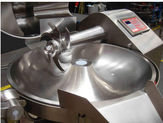
Figure 2: Bowl chopper.

Manual or motorised meat grinders are used for most types of sausages, but processors who wish to make emulsion-type sausages or those who can afford higher levels of investment use bowl choppers (Figure 1). These machines have a slowly rotating horizontal bowl that moves the ingredients beneath a set of high-speed rotating blades. Coarsely chopped meat and the other ingredients pass several times beneath the blades until it is chopped and blended to the required extent.