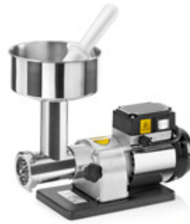
Figure 1: Meat grinder.

A meat grinder (Figure 1) forces meat under pressure through a cylinder with sharp-edged ribs and then through a series of holes in a perforated plate. As the compressed meat exits through the plate, a revolving four-bladed knife cuts it. The meat should be thoroughly trimmed of fat and connective tissue, sprinkled with the seasoning mixture and then ground twice: once through a coarse plate (8-12 mm holes) followed by mixing in any binder and a second grinding through a finer plate of 2-4 mm diameter holes.