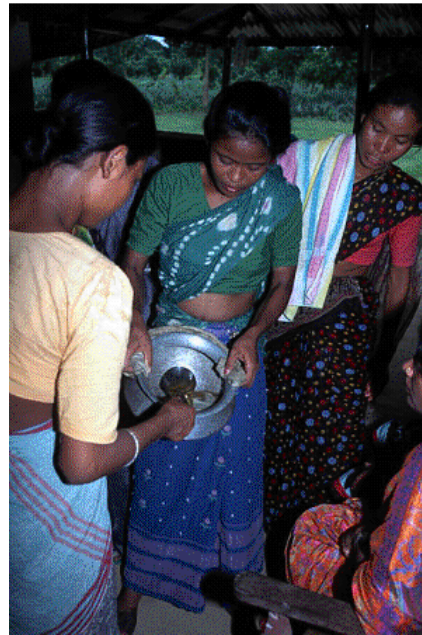
Figure 1: Testing for the end point of jam. A food processing training course in Bangladesh.

Jams are solid gels made from fruit pulp or juice, sugar and added pectin. They can be made from single fruits or a combination of fruits. The fruit content should be at least 40%. In mixed fruit jams the first-named fruit should be at least 50% of the total fruit added (based on UK legislation). The total sugar content of jam should not be less than 68%.