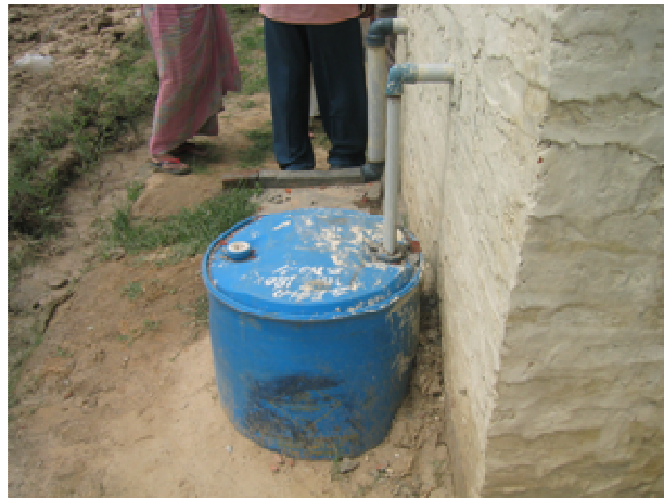
Figure 2: With urine separation one option is to collect the urine so that it can be used as a liquid fertiliser later on.

Compost toilets are often built with two chambers for simplicity of construction and operation. The two chambers are used alternately; decomposition continuing in the full one until it is emptied just prior to the other one becoming full. Each chamber has its own opening for removal of mature, non-odorous compost. Some types of compost toilet batch the waste in movable receptacles on trolleys or turntables whilst others generate the compost slowly and continuously as the material progresses through the device. Some require electricity for small heating elements (in cold climates) or fans (to ensure a positive airflow through the system). Some compost toilets combine the urine and faeces whilst others separate them. The compost formed by the combination of urine and faeces is better as the urine contains valuable nutrients but these toilets are more likely to smell if used carelessly and they require much greater quantities of carbonaceous residues like sawdust and straw. However, urine can be used on its own as a liquid fertiliser so that the nutrients are not lost. It is collected and stored for a time before being used on agricultural land. It is relatively safe to handle and store. More complex types of compost toilet design require dry access under the toilet via a basement or cellar room.