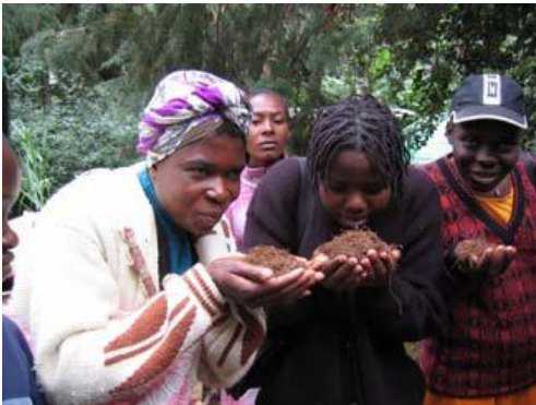
Figure 3: Inspecting mixed compost.

In some forms of ecosan urine diversion does not take place and the faeces are mixed with the urine. In this case the waste is treated in the same way as faeces. The most established ecosan systems using this method are the Fossa Alterna and the Aborloo. If removed from the pit the resulting compost is similar to that from just faeces, carrying no offensive smell and resembling soil (figure 3).